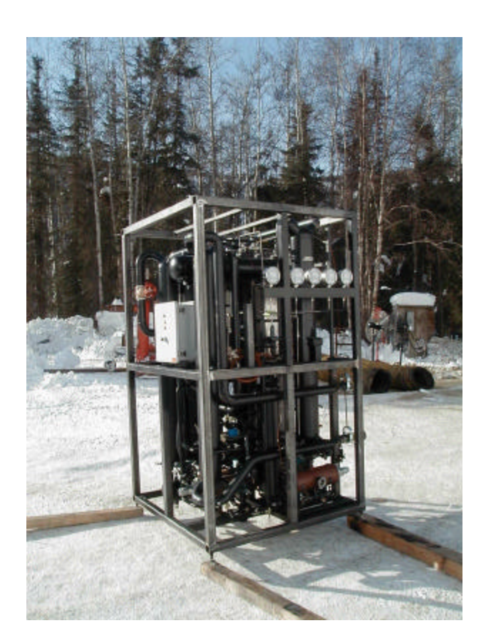
Fig. 3 Double lift ThermoChiller prior to installation