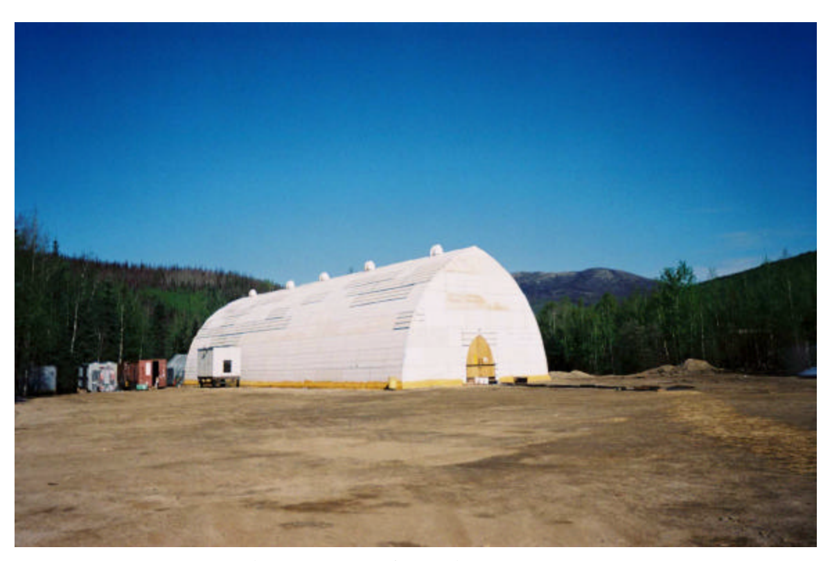
Fig. 2 Ice Hotel frozen in summer